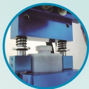
▲ Patented Ink-Scraping Structure