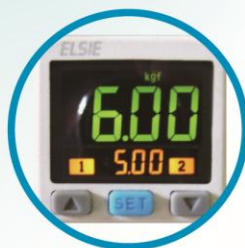
▲ Electronic Pressure Sensor