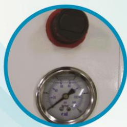
▲ Adjustable Ink-Cup Pressure